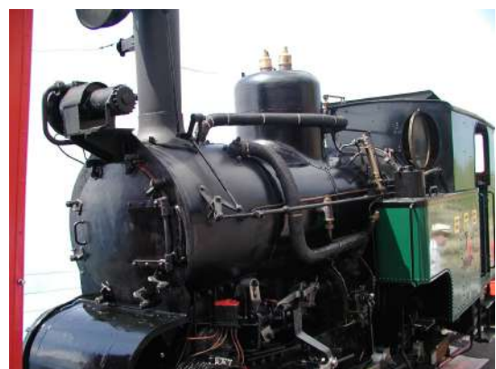
No2 BRB to visit the SMR for 4 weeks from September 1 st

Like the SMR the BRB has gone through some difficult times especially regarding the continued use of steam traction. Both railways however, have retained their SLM steamers, but have also bought a number of modern diesel hydraulics (Hunslet and Steck) locos to supplement the timetable or to be run when demand is light. Unlike other Swiss mountain lines, the BRB was not electrified and this made the railway a special attraction as from 1953 to 1990 it was the only steam-operated line in Switzerland. To maintain this service 4 new steam locomotives were ordered from SLM to a design by Roger Waller between 1992 and 1996.