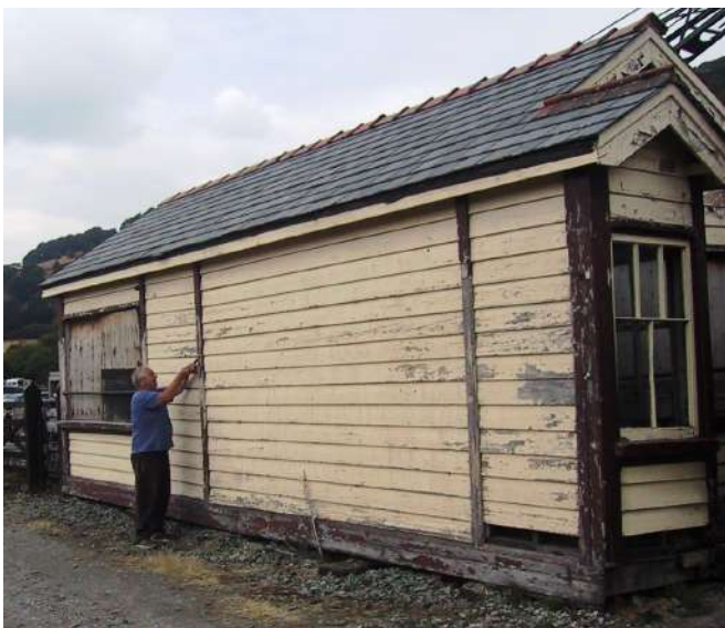
Scraping down the main frame and boards

main structure of the signal box. If track were added at this time then a “one piece” move of the operating floor would be impossible. In preparation for the move, a small team of volunteers have been busy rubbing down the wood of the signal box's back wall ready to receive undercoat – tinned donations to which would be much appreciated!