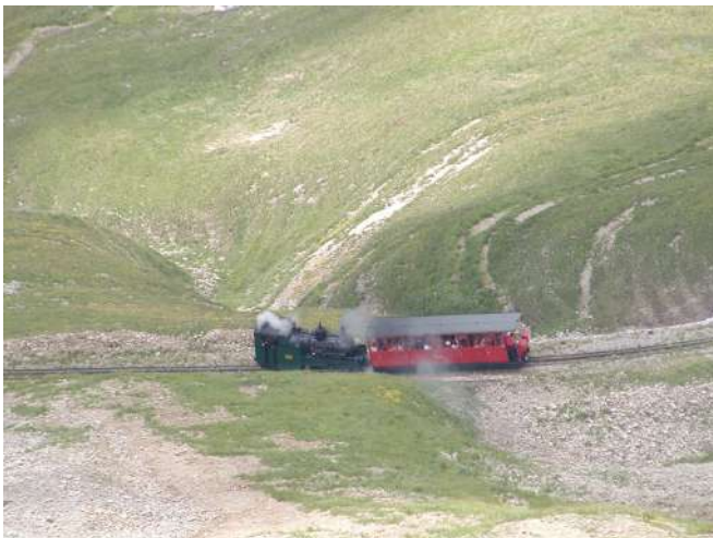
No2 makes its way down the Rothorn

These locos are very powerful and capable of delivering a continuous output from the boiler, but controlled solely by the driver. They use heating oil as the main fuel for the boiler and are monitored electronically to ensure water in the boiler and the firing is at an optimum level for the work required. The sound from these engines is truly amazing – 7.6km of roaring chuff which then turns to silence when the job is over!