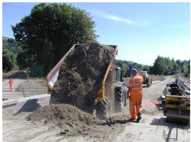
10 tonnes of infill arrives at the west end

“quarry” to the void between the platform walls. With modern machinery, this has meant the movement of between 300 – 400 tonnes of material to be levelled and compacted. Supporters of the Tenner a Tonne Appeal can now see how their donations are starting to pay off.