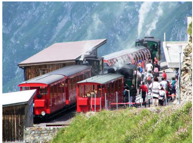
No12, No14 and No2 (on Rt) at the Rothorn Kulm (summit) Station

station on the BRB is at 2,244 m (7,362ft) whilst the SMR's summit is at 1,065m (3,493ft).