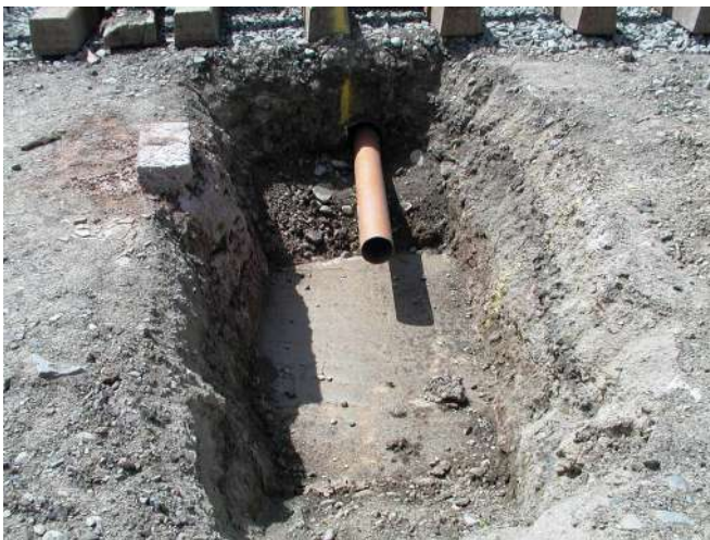
Foundation for the receiving chamber

A similar infill activity has been taking place at the east end of the platform where material is being added to the void of the single platform.. This part is not so accessible for machinery, save for load delivery which then has to be shovelled and barrowed by the workforce.