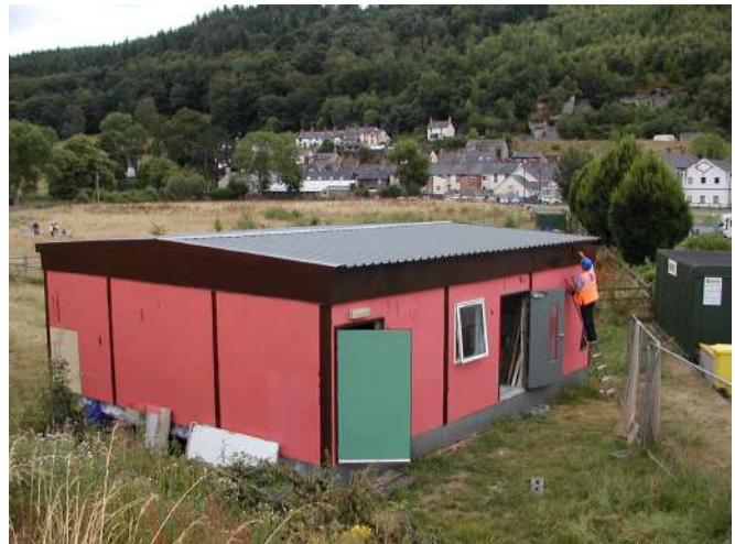
New doors, new roof and painting underway

contractor during his Sunday off! In the meantime staff from Coleg Cambria have helped to hang new doors to the building and reorganise the internal layout.