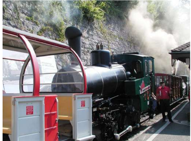
No12 prepares to depart Brienz with little or no smoke. Note coal fired No2 also making ready!

The SML locos are coal fired and date from 1891 through to 1896. The 1891 loco No2 from the BRB is to visit Snowdon. The locomotive will make a 3 day journey on the back of a lowloader from Brienz to Llanberis during August in anticipation of services starting on September 1 st . No2 will be in residence and at work on the SMR for 4 weeks before returning home. It is understood that No2 will undergo some firebox repairs along with other maintenance tasks before setting out for North Wales.