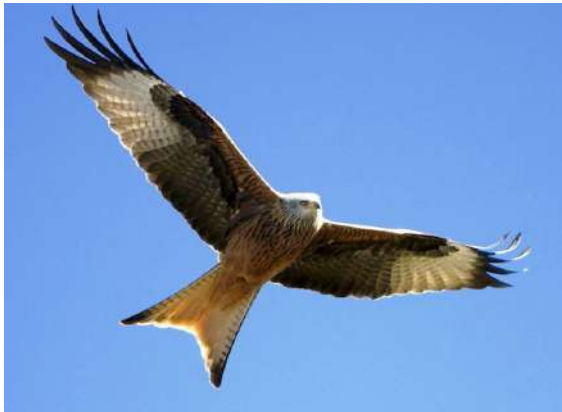
Red Kite ( milvus milvus )

As reported in an earlier edition of CCNL, a decision has been made to put the maximum labour effort into completing the locking room of the signal box with a view to bringing the operating floor down from Carrog yard quite soon.