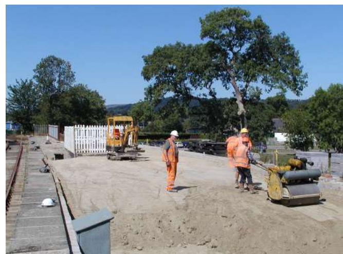
Rolling and compacting infill

The fact that so much material can be brought down to the site during short working periods is very encouraging and quickly frees up volunteers to get on with other vital tasks. If you can, please keep the Tenners coming so we are able to reach at least £8,000 before the summer is out.