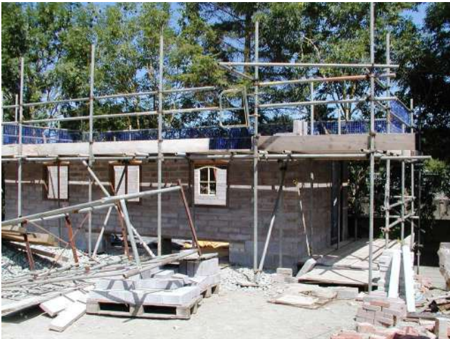
Locking room showing window frames and level 2 scaffold

In the skies a number of Red Kites have been spotted as a sign of their growing numbers and a determination to push north. Sightings have also been reported in Northamptonshire as examples come up from their release areas in Oxfordshire. The good weather has at least